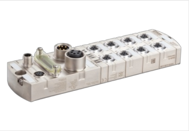
Product may differ from Image

Digital inputs DI8 DI8 CAN 1 Mbit/s; M12, A-coded 7/8", 5-pole, 2× max. 9 A M12, 5-pole, A-coded Connection cables are in the online shop under "Connection Technology". Housing fully potted.